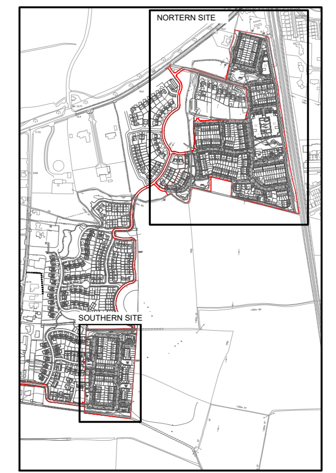
KEYPLAN PLAN SCALE 1:5000

Note: Forward Swept Path Analysis Shown in Red. Reverse in Blue